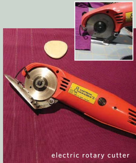
electric rotary cutter