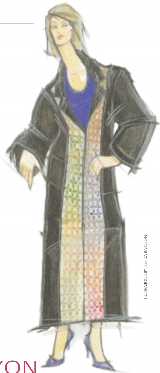
ILLUSTRATIONS BY JESSICA LEVINSON