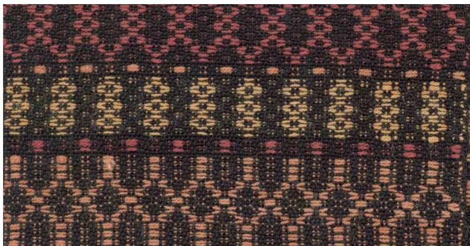
A point threading of four overshot blocks allows a great many different designs.